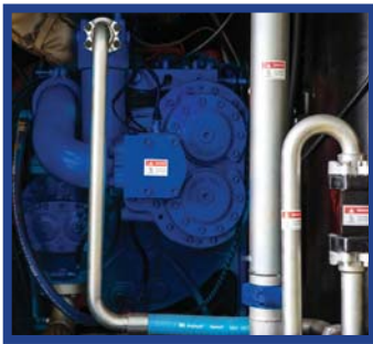
HIGH EFFICIENCY TWO STAGE AIR END