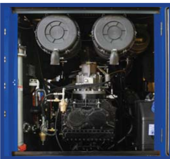
IMPROVED CAPACITY CONTROL