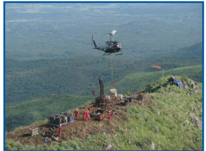
NCA Helicopter Portable Compressors in operation on a remote mountain site

At NCA, we believe in imparting the maximum knowledge to our customers through specially designed training programs on equipment and processes that help them operate our equipment most effectively. Training programs can be conducted by our factory trained personnel at any location around the globe